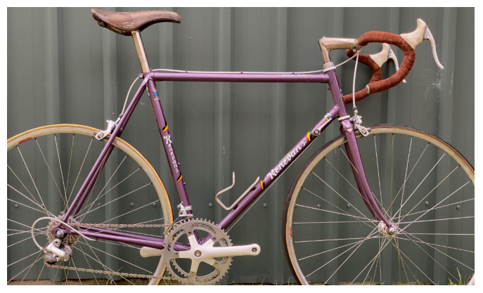
Viscount Sprint mid 1980's 56 x 56cm original paint $150

1980's 56 x 56cm light 653 tubing, recent repaint by Gefsco, NOS Santé groupset $850